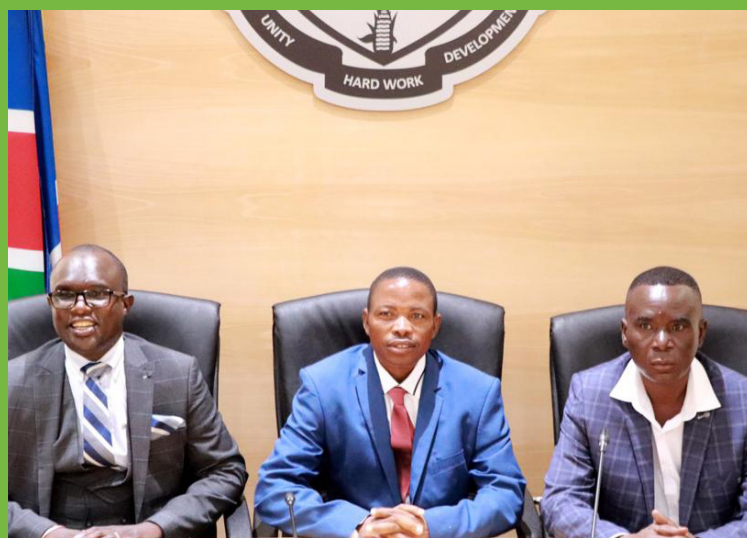
Hon. J. Likando Member of Parliament

Hon. Simushi also thanked the Governor, former Chairperson of the Management Committee and the 5th Council of the Zambezi Regional Council for the work well done during 2015-2020.