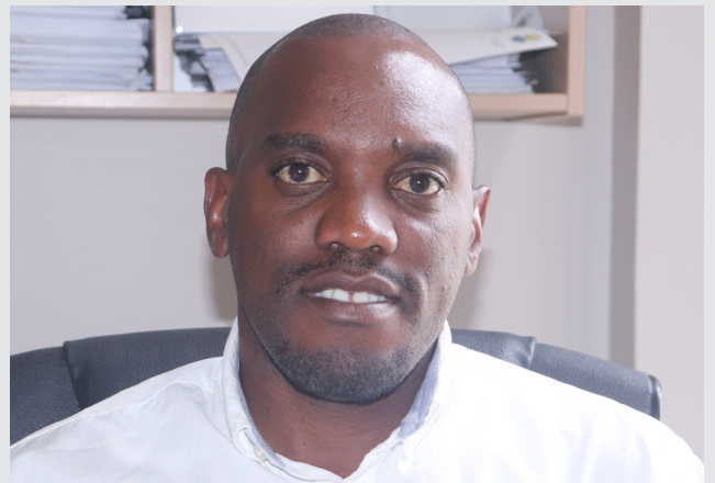
Editor: Damien Siambango